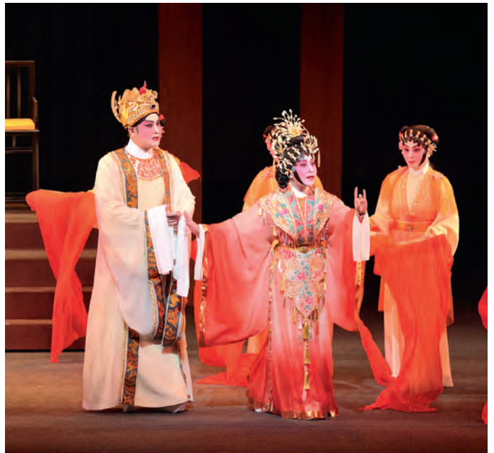
Right: A scene from the new version of the Cantonese Opera The Last Emperor of Southern Tang , opened the Chinese Opera Festival held between June and July.