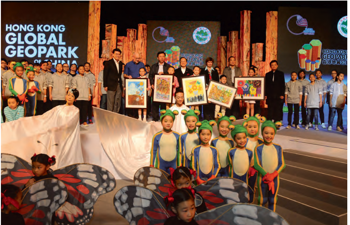
Above: In December, the Chief Executive, Mr Donald Tsang, and Mainland officials from the Ministry of Land and Resources and representatives from the Global Geopark Network, officiated at the opening of the Hong Kong Global Geopark of China, recognised worldwide as a significant example of geological natural heritage in the region. (Right) The volcanic rock formations at High Island Reservoir in Sai Kung Peninsula are part of the Hong Kong Geopark nature conservation area.