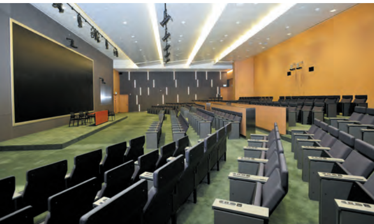
Left: The new CGO Auditorium is equipped with facilities for seminars, briefings and video conferencing.