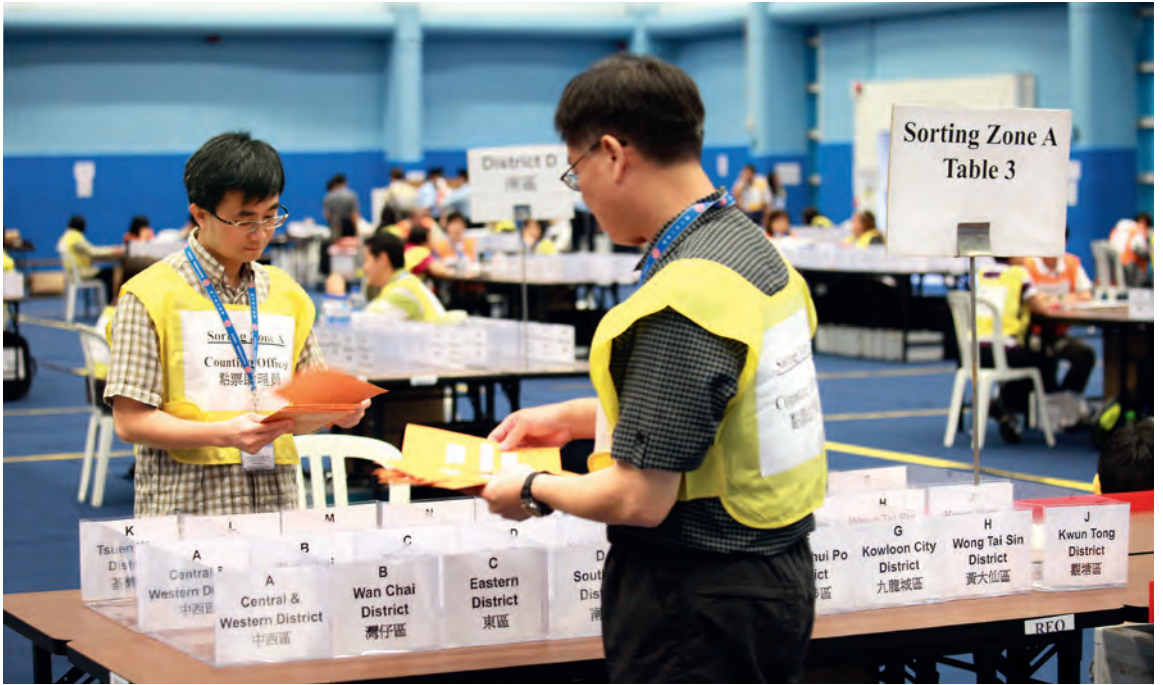
Above: Election staff sort District Council Election ballot papers at the Kowloon Park Sports Centre for delivery to respective constituencies for counting.