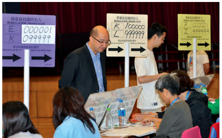
Right: The Secretary for Constitutional and Mainland Affairs, Mr Raymond Tam, at the St Stephen's Girls' Primary School's polling station where he cast his vote.