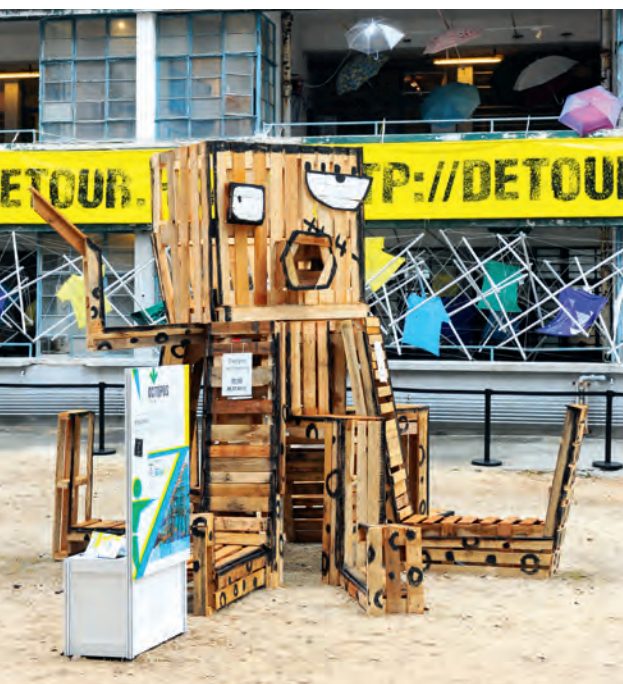
Above: ART HK 2011 held in May, which has become a key event in the international arts calendar, featured exhibits from the leading galleries of the Asia Pacific and the West. Left: Detour 2011, held from November 25 to December 11 at the former Police Married Quarters on Hollywood Road, highlighted the effects of irresponsible consumerism as well as inspired eco-living.