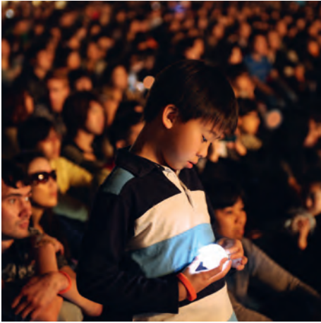
Above: A young boy expresses his sadness at the 'Artistes 311 Love Beyond Borders' concert in April, and ( above right ) children donate their money to help Japan.