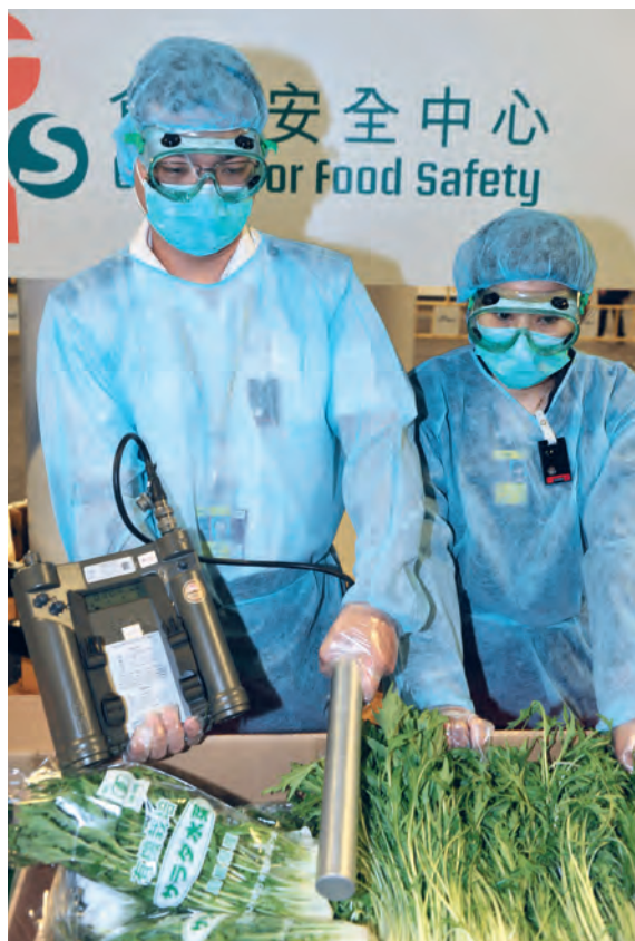
Above: Inspectors from the Airport Food Inspection Office examine vegetables from Japan for possible radiation contamination at Hong Kong International Airport.