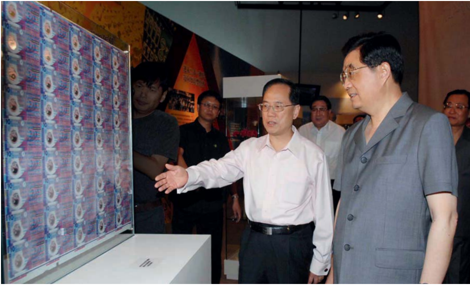
The Chief Executive and President Hu Jintao look at Hong Kong's new $10 polymer note ( above ), and with Premier Wen Jiabao at the 'A Decade of Achievements' exhibition held in Beijing in June, to celebrate the 10th anniversary of the HKSAR.