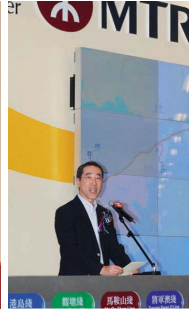
Above: The Chief Secretary for Administration, Mr Henry Tang, speaks at the rail merger celebration ceremony of the Mass Transit Railway and Kowloon-Canton Railway systems on December 2.