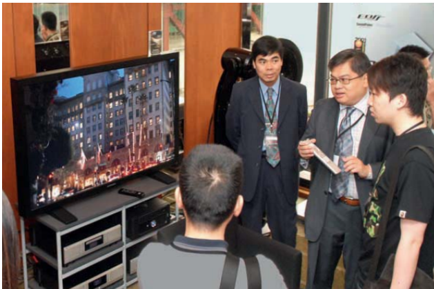
Right: Hong Kong entered a new era with the launch of digital terrestrial television broadcasting on December 31, prompting keen interest in the latest high definition televisions at this audio visual exhibition.