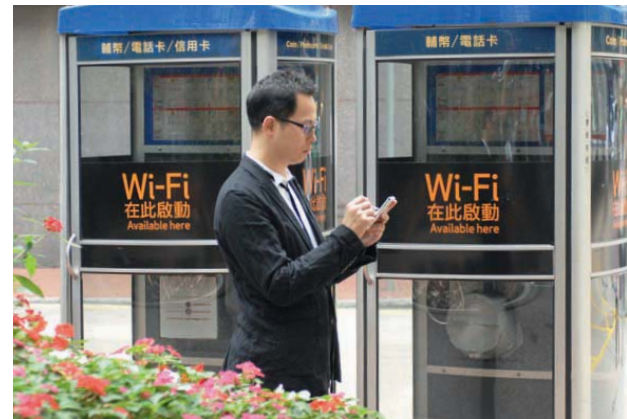
Left: Hong Kong's status as a leading digital city has been boosted further by the rapid and extensive rollout of a wireless Local Area Network in 2007. At year-end, there were more than 5 000 Wi-Fi hot spots at about 3 100 locations.