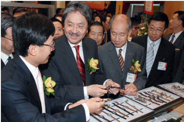
Right: The Financial Secretary, Mr John C Tsang, visits the Hong Kong Watch & Clock Fair 2007, which attracted more than 800 exhibitors from 18 countries and regions in September.