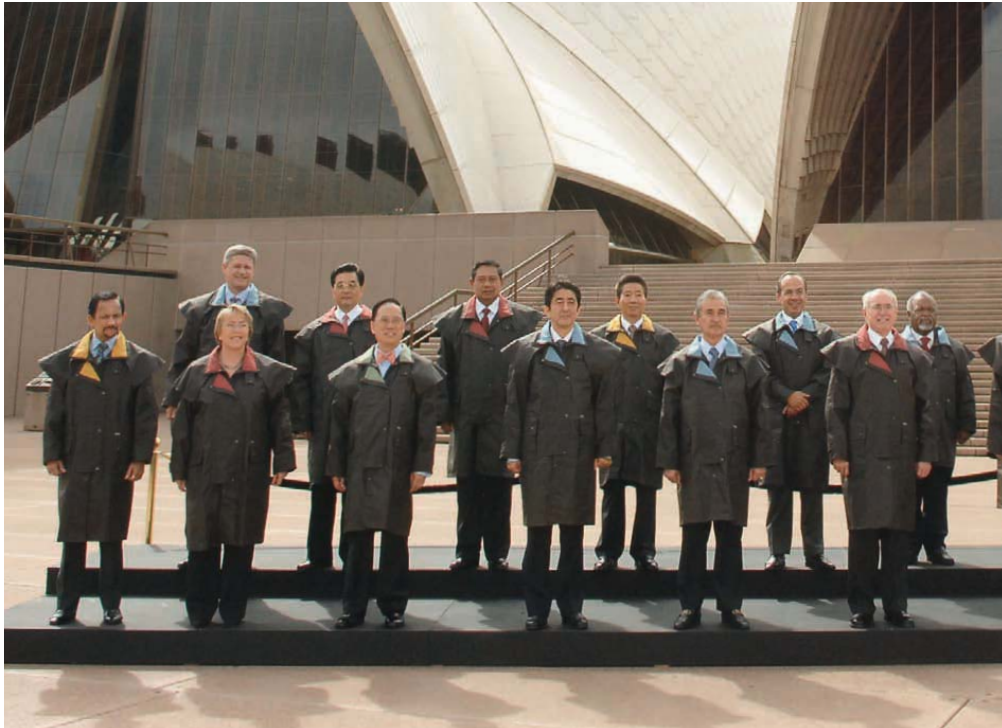
Above: In September, economic leaders, including the Chief Executive, wear traditional Australian coats at the 15th Economic Leaders' Meeting of Asia-Pacific Economic Cooperation in Sydney.