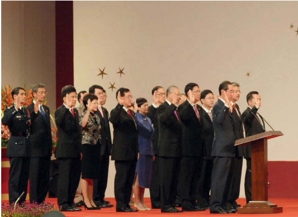
Top: President Hu Jintao swears in the Principal Officials at the inauguration ceremony of the Third Term HKSAR Government.