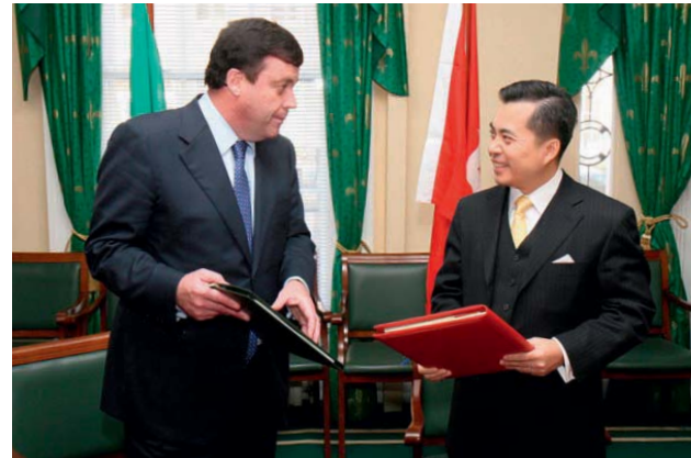
Left: In October, the Secretary for Justice, Mr Wong Yan Lung, and Ireland's Minister of Justice, Equality and Law Reform, Mr Brian Lenihan, exchange documents after the signing in Dublin of the Surrender of Fugitive Offenders Agreement between the HKSAR and the Republic of Ireland.